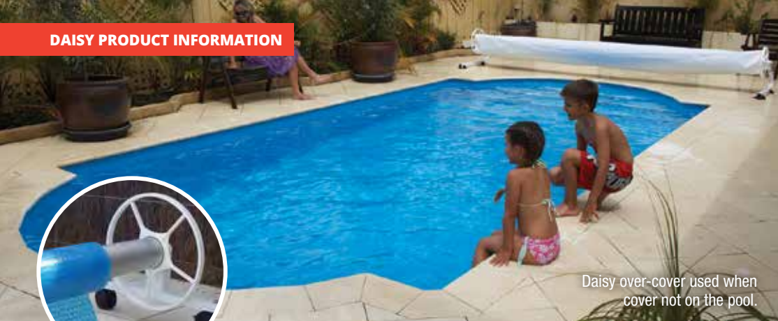
Daisy over-cover used when cover not on the pool.

Once installed, your cover and roller are easy to move away.