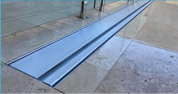
Below Ground Box