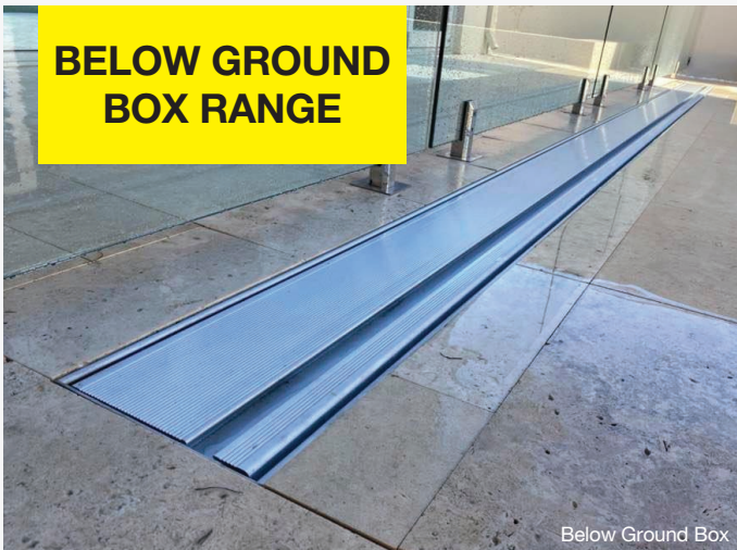
Below Ground Box