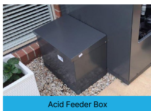
Acid Feeder Box